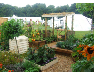
Incredible Edible Garden

Next time you visit the Colonial Cafe, be sure to have a look at the pictures, certificates and medals from the show, or flick through the photograph albums while you are having a coffee.